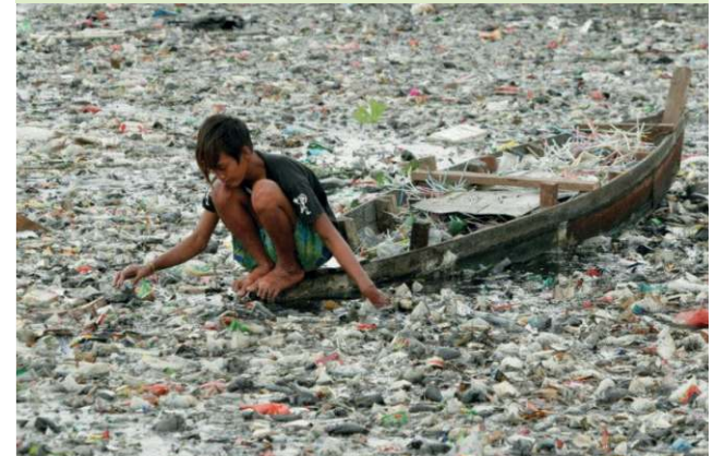
There is no climate crisis. There is a pollution crisis.

Yet the trillionaires behind the so-called climate emergency never once talk about cleaning up our only home: Earth. If they really cared about Earth and our health and well-being, which is directly connected to nature, wouldn't they be worried about the massive pollution that is affecting us all? This alone proves that it's a made up emergency just like the plandemics past and present.