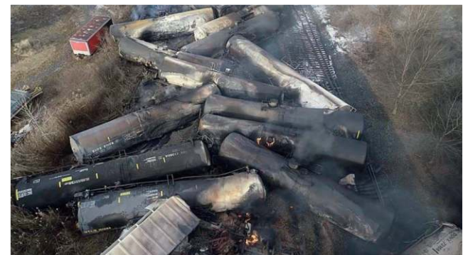
36 train derailments so far this year and counting: Arizona, West Virginia, South Carolina x3, Texas x3, Ohio x5, Oklahoma x2, Michigan, Nebraska, Californian x3, Philly, Alabama x2, Alaska, Louisiana, Florida, Massachusetts, North Dakota, Minnesota, Montana, Pennsylvania, Virginia, Maine, Illinois x2, Kansas...

Yet the trillionaires behind the so-called climate emergency never once talk about cleaning up our only home: Earth. If they really cared about Earth and our health and well-being, which is directly connected to nature, wouldn't they be worried about the massive pollution that is affecting us all? This alone proves that it's a made up emergency just like the plandemics past and present.