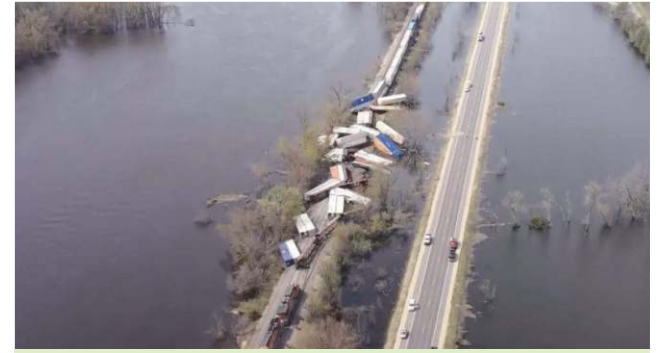
What are the chances, that the trains always derails right on big waterways, where they can pollute the most?

"If they knew what we have done, they would chase us down the streets...", George Bush Senior